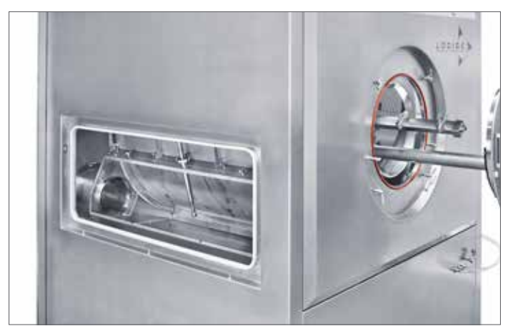
Lödige Coater type LC light series: View of the exhaust air unit

The "air guidance around the coating drum" developed by Lödige ensures optimum tablet coating results. During this process, warm air is introduced through an inlet air distributor and flows around the coater drum, with air entering the drum through the perforation along a large circumference.