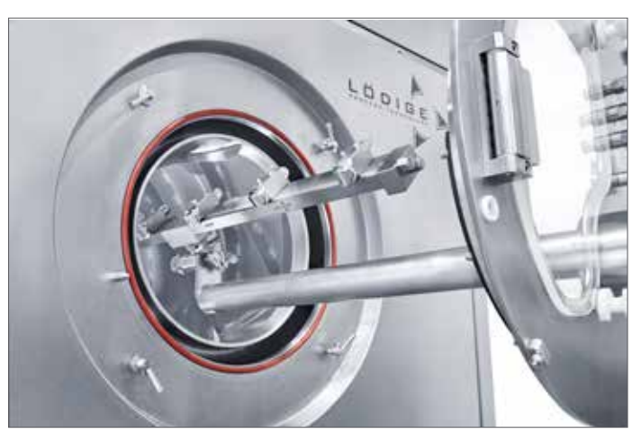
Lödige Coater LC light series: view of the nozzle arm