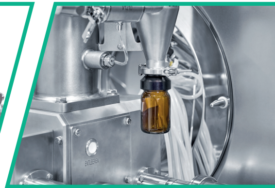
Automatic Sampling using a Pneumatic Vacuum System. No direct contact with the Product. Increased operator safety!

The following products can be processed with a suitable coating drum design: