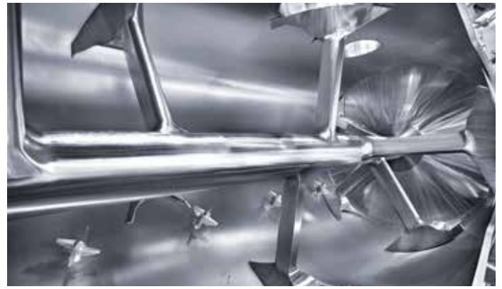
Ploughshare® Mixer for batch operation type FKM Hygienic Design

Basically the Lödige Ploughshare® Mixer of type FKM for batch production has a filling degree of approx. 25 - approx. 75 % of the total volume. The optimal filling degree depends on the application and can therefore vary according to the product mixed.