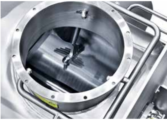
WIP pipework in the inlet