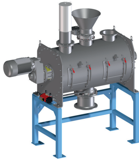
FKM 1200 LS