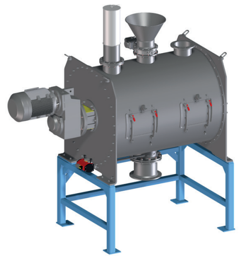
FKM 3000 LS