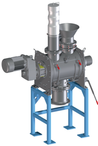
FKM 130 LS